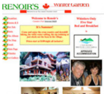
Screen capture www.renoirs.ca

Images are the first thing visitors see when they come to a website. They make or break a first impression. Which one of the 3 homepages below makes a better, more professional first impression?