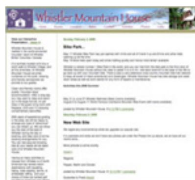
Screen capture www.whistlermountainhouse.com

Homepage doesn't convey a professional message