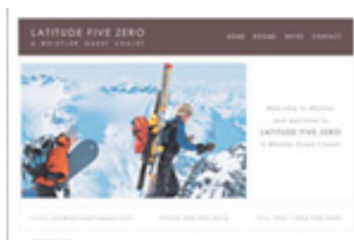
Screen capture www.latitudefivzero.com

Homepage conveys a professional first impression